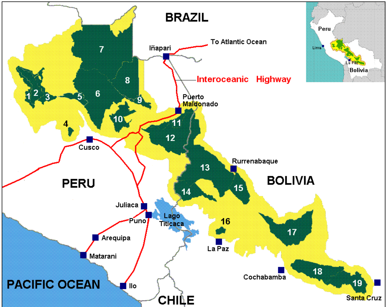
Figure 2. The Vilcabamba-Amboró Conservation Corridor and the route of the Interoceanic Highway that will bisect it. Protected areas (green): 1, Ashaninka Comunal Reserve; 2, Otishi National Park; 3, Matsigenka Comunal Reserve; 4, Machupicchu Sanctuary; 5, Megantoni Reserved Zone; 6, Manu National Park; 7, Alto Purus National Park; 8, State Reserve for Isolated Indigenous Peoples; 9, Los Amigos Conservation Concession; 10, Amarakaeri Comunal Reserve; 11, Tambopata National Reserve; 12, Bahuaja Sonene National Park; 13, Madidi National Park; 14, Apolobamba Biosphere Reserve; 15, Pílon Lajas, Biosphere Reserve; 16, Cotapata National Park; 17, Isiboro Secure National Park; 18, Carrasco National Park; 19, Amboró National Park. Buffer zones (yellow).